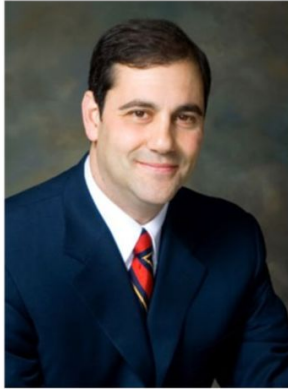
ANDREW J. LANZA

State Senator, 24 th District 3845 Richmond Ave. Suite 2A Staten Island, NY 10312 718-984-4073 Lanza@nysenate.gov